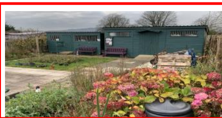
The Sales Hut—re-opening 7th March

The hut will be open as planned at 10:00-12:00 on 7th March, so here's hoping for a nice dry day with a good helping of sunshine.